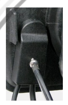
Fig 4 Fig 3

Fig 5 Remove the tabs at the bottom of the strain relief on the back side of the back plate (fig 3).